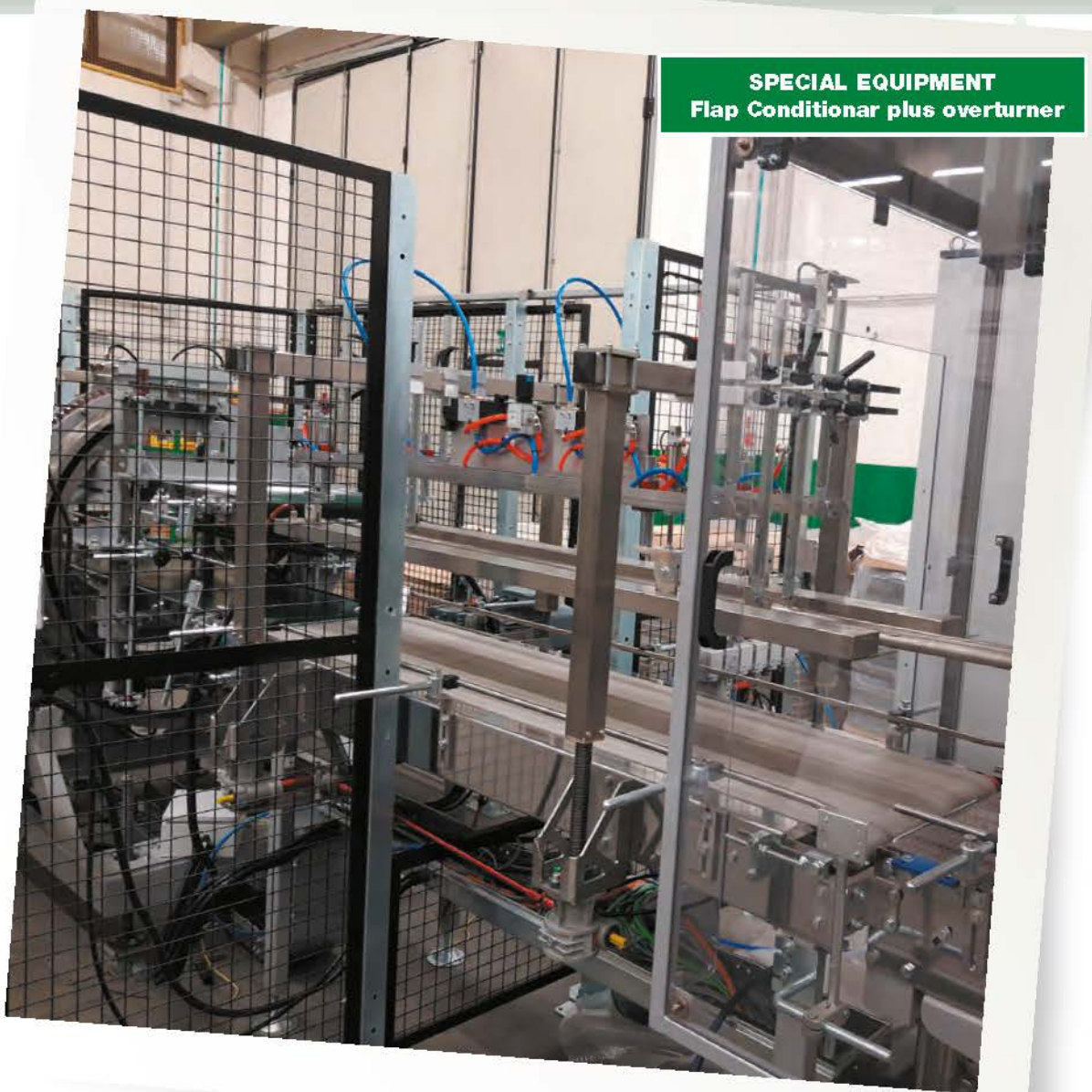
SPECIAL EQUIPMENT Flap Conditioner plus overturner